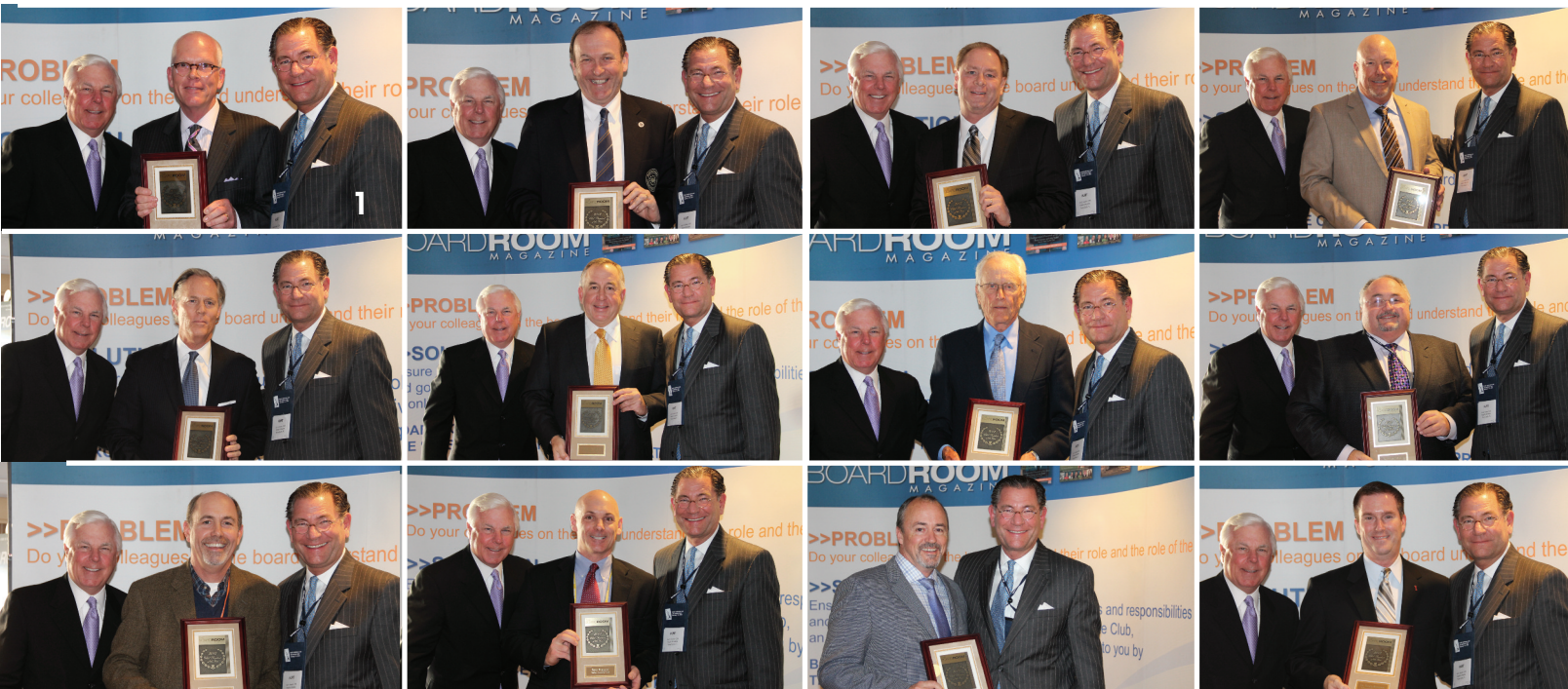
Club presidents, or club general managers accepting on behalf of the club presidents, at the 2012 Top Private Club Presidents reception at the CMAA World Conference and Expo in San Diego, CA this past February.